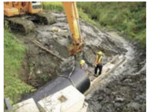
The culvert was sliplined with DN/ID 96 inch (approximately 2.4 m) Weholite. With a small work force of only four men, the team completed the project in record time.